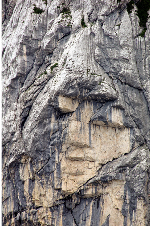
The Ajd Girl

When the other Ajdov Girls heard this prophecy, they cursed her for predicting the death of the Goldenhorn. As a result, she turned into stone when she returned to Prisojnik.